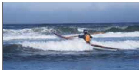
Breaking through surf Greenland style.

The blade itself is symmetrical; there is no front or back. This gives the paddle very predictable characteristics in the water, which some find both reassuring and advantageous when performing steering and